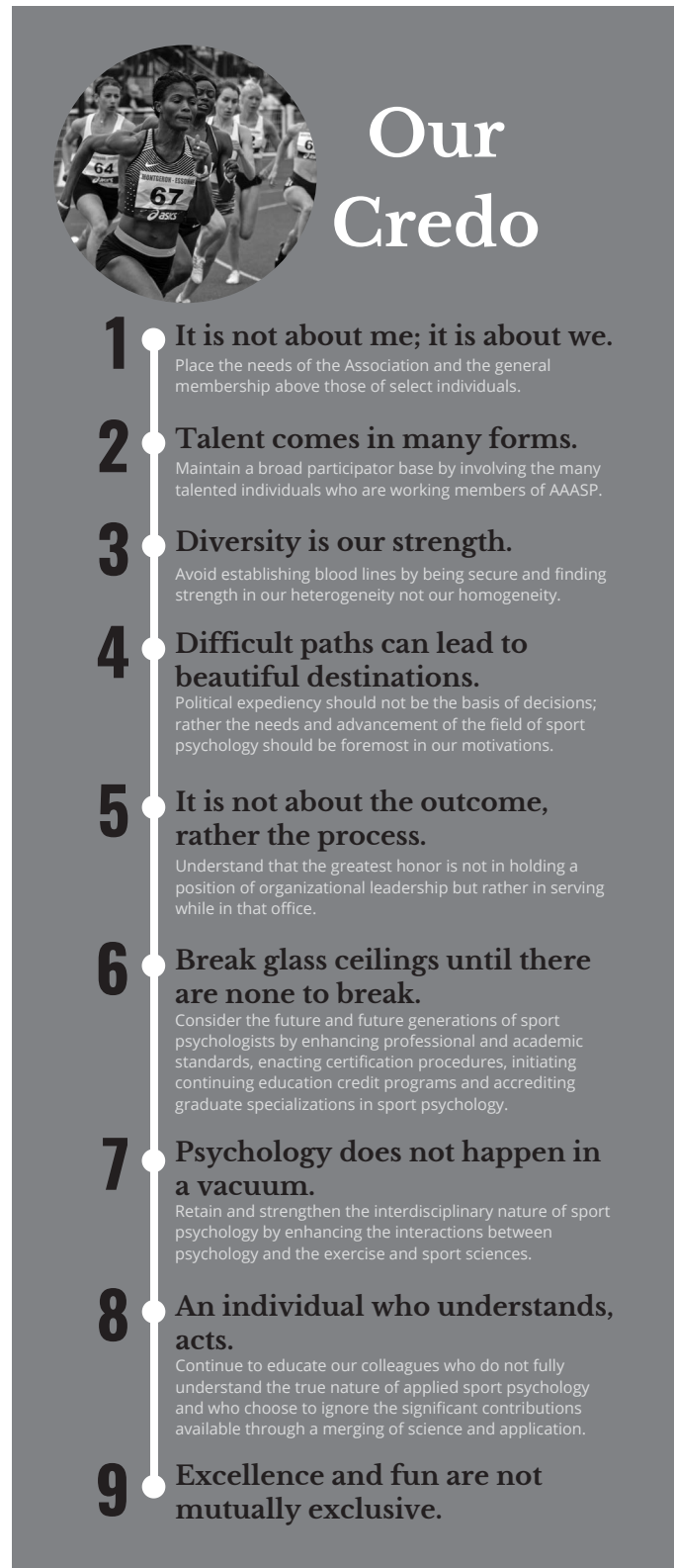
Figure 1. Guiding Principles